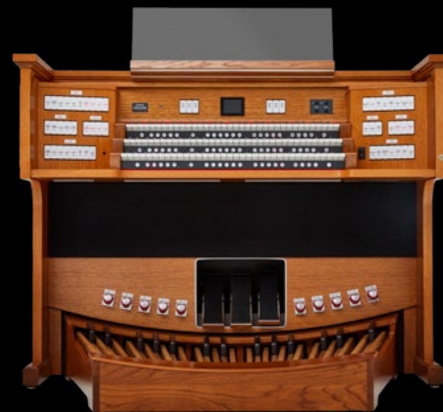
IMAGINE SERIES 351T