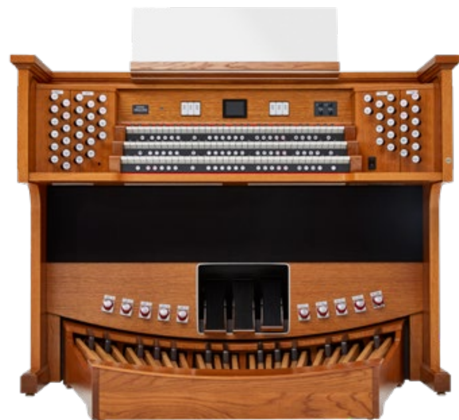
IMAGINE SERIES 351D