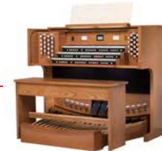
ARTIST SERIES 599

Height: 124.84 cm (49.15") Width: 148.1 cm (58.31") Depth: 73.95 cm (29.11") Depth with pedalboard: 122.79 cm (48.34")