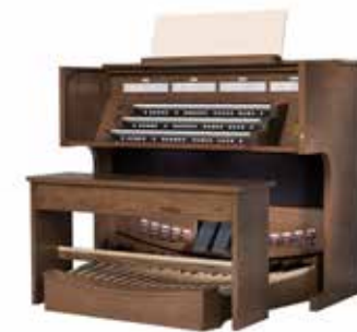
ARTIST SERIES 589

Height: 124.84 cm (49.15") Width: 148.1 cm (58.31") Depth: 73.95 cm (29.11") Depth with pedalboard: 122.79 cm (48.34")