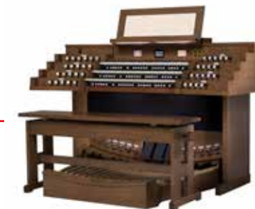
ARTIST SERIES 599T

Height: 120 cm (47.0") Width: 181 cm (71.2") Depth: 84 cm (32.7") Depth with pedalboard: 125 cm (48.9")