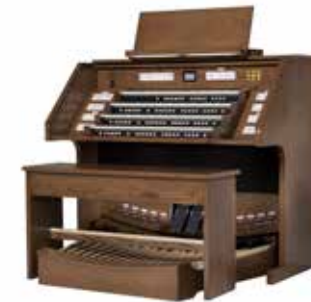
ARTIST SERIES 4589

Height: 124.84 cm (49.15") Width: 148.1 cm (58.31") Depth: 73.95 cm (29.11") Depth with pedalboard: 122.79 cm (48.34")