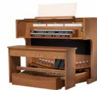
ARTIST SERIES 579

Height: 117.59 cm (46.30") Width: 148.1 cm (58.31") Depth: 67.98 cm (26.77") Depth with pedalboard: 116.44 cm (45.84")